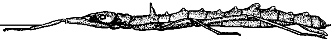
Figure 1. Female Dinophasma guttigera , side view.

Westwood placed this species (and three others) in the genus Phasma because he was unsure where it belonged: "The following insects differ so materially from all other apterous species, that I am uncertain (in the absence of males of each) whether they should be referred to other groups of the Apterophasmina, or be raised to the rank of separate genera. In this uncertainty I prefer leaving them under the old generic name Phasma " (Westwood 1859: 34). Redtenbacher (1906: 86) created the genus Dina for this and two new species, however the name Dina was already in use for a group of worms and Uvarov (1940: 173) proposed Dinophasma to replace Redtenbacher's name. Günther's use of Dina in 1943 is no doubt due to both his and Uvarov's papers being published during the second world war.